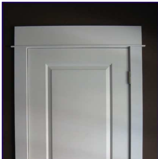
Arts and Crafts Moulding