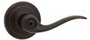
Nickel Knobs & Levers