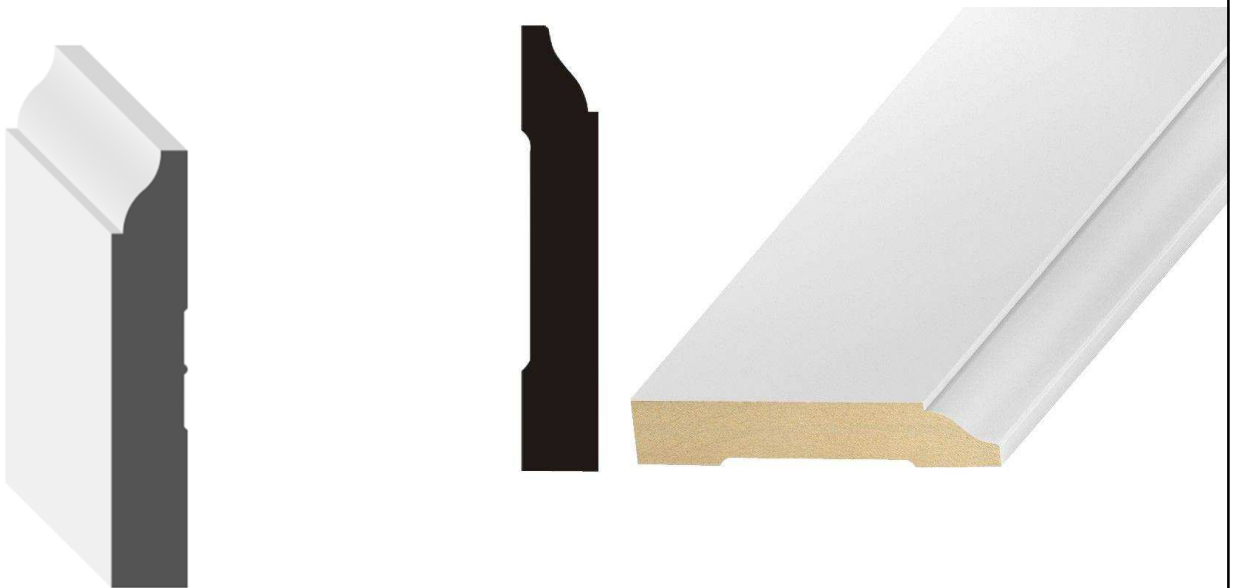
3-1/4" Colonial Base Moulding