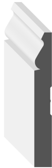
5-1/4" Base Moulding